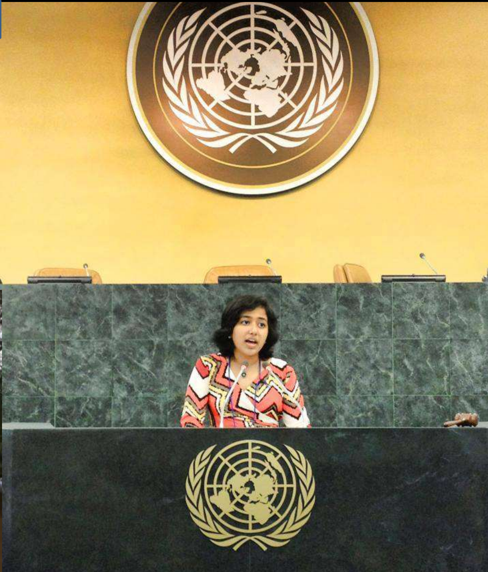
At United Nations , New York