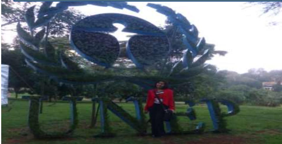
UNEP headquarters, Nairobi