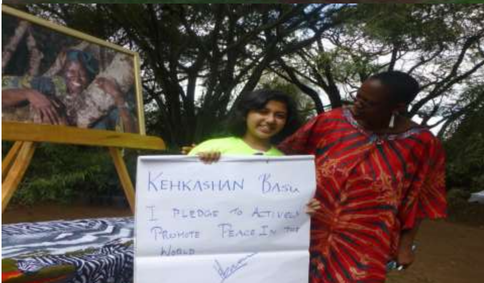
At Wangari Maathai's organisation in Nairobi