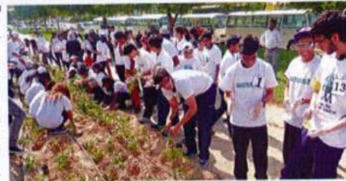
Green crusaders from Environmental Academy plant saplings.