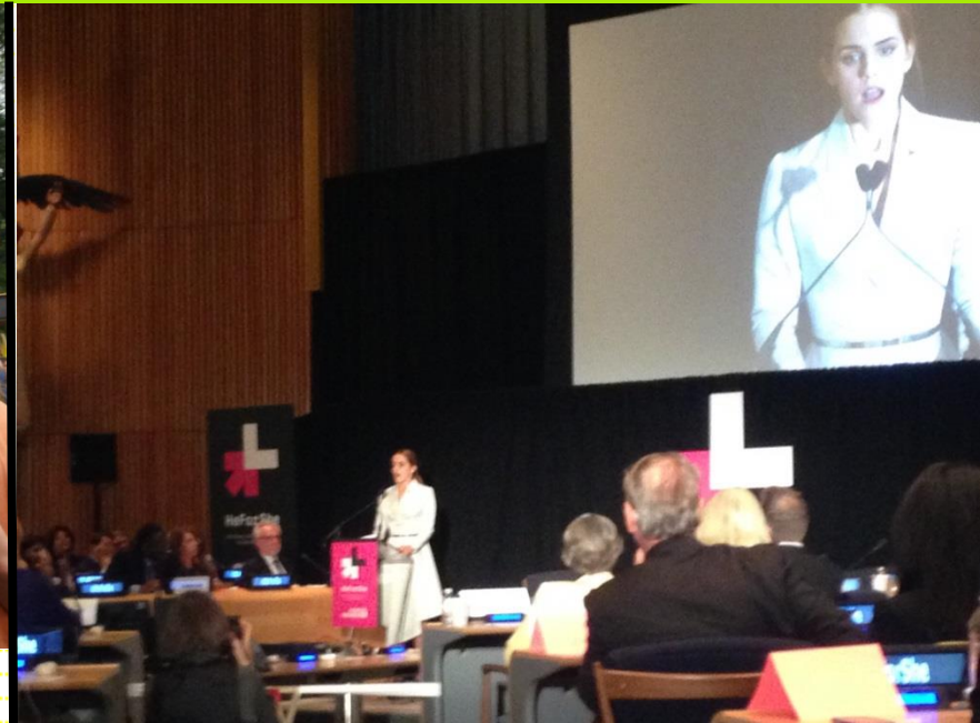
Emma Watson launching the He4She Campaign @ the UN Headquarters