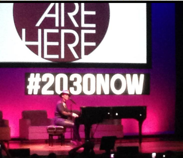
@ the Social Good Summit