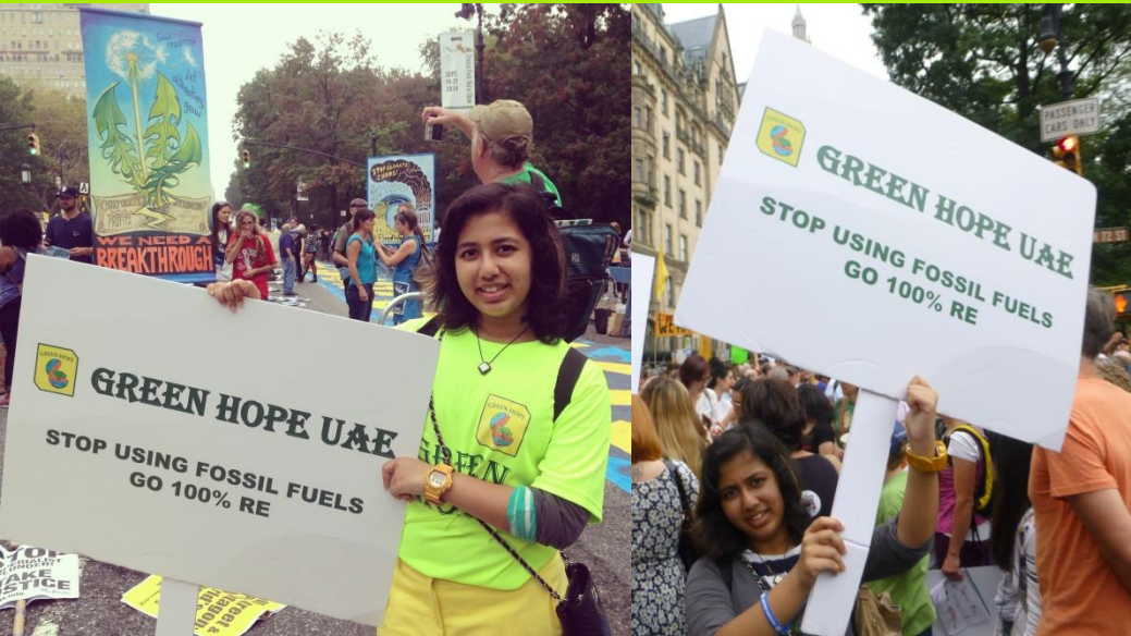
@ the Climate March